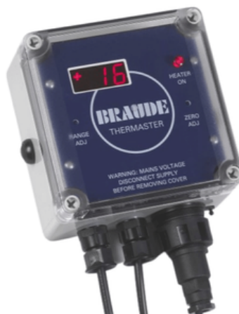
Thermaster Temperature Controller