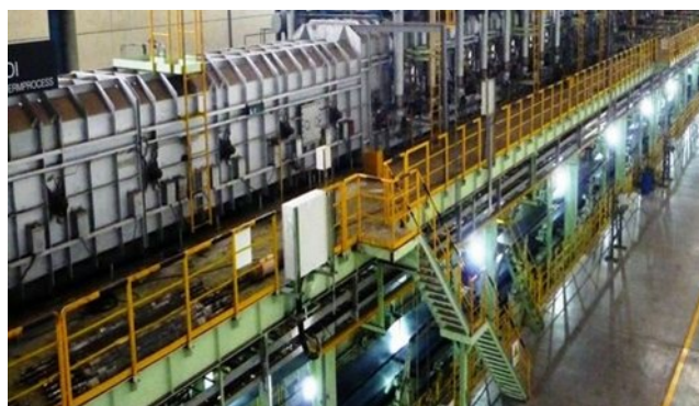
Strip pickling line