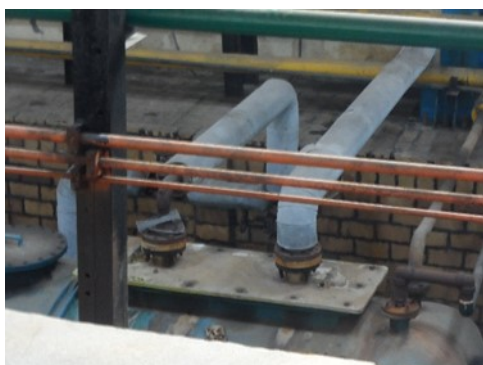
Heat Exchanger in Situ