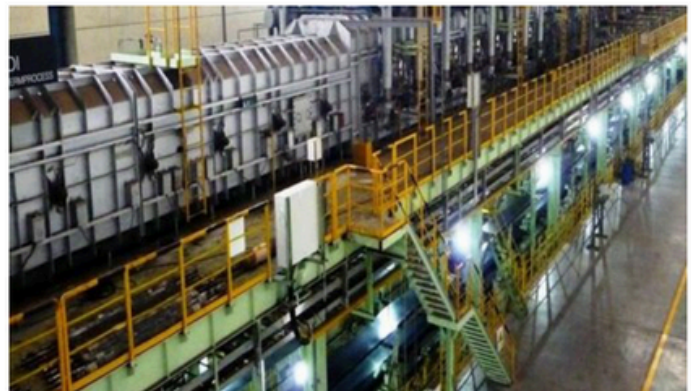
Strip pickling line